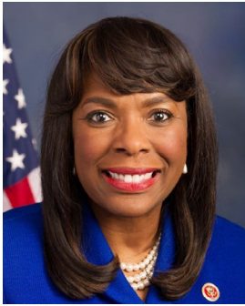
Representative Terri A. Sewell (D-AL)