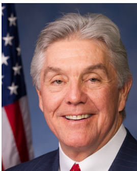
Representative Roger Williams (R-TX)

Congresswoman Terri A. Sewell is in her sixth term representing Alabama's 7th Congressional District. She is one of the first women elected to Congress from Alabama and is the first black woman to ever serve in the Alabama Congressional delegation. Congresswoman Sewell sits on the House Ways and Means Committee and brings to the committee more than 15 years of experience as a securities and public finance attorney. She is a member of the Congressional Black Caucus where she is Co-Chair of the Voting Rights Task Force. Congresswoman Sewell is also a member of the New Democrat Coalition; Co-Chair of the Congressional Voting Rights Caucus; Vice-Chair of the Congressional HBCU Caucus; and Co-Chair of the Rural Caucus.