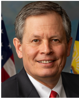
Senator Steve Daines (R-MT)