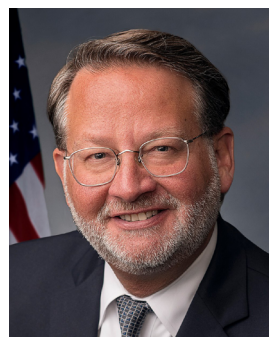
Senator Gary Peters (D-MI)

Congressman Roger Williams has represented the 26th District of Texas since 2013, and has won every election with more than 50% of vote. Prior to running for the U.S. House of Representatives, Congressman Williams was the Secretary of State of Texas under Governor Rick Perry. In Congress, he sits on the House Financial Services Committee and the House Small Business Committee where he is a strong supporter of free markets, limited regulation, and consumer choice.