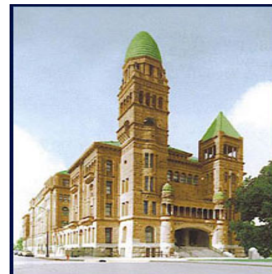
Bexar County Courthouse

MBA's National Technology in Mortgage Banking Conference & Expo | March 25-28, 2007 Tampa Convention Center Tampa, FL