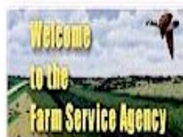
Farm Service Agency

NOTE: New User button and Log On hyper link for EDI have been moved to the EDI menu.