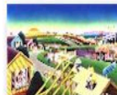
Rural Housing Service